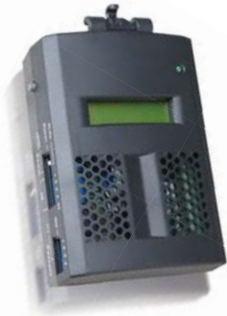
Backlight LCD display

EnviroProbe offers temperature and humidity monitoring in a single rack or a specified area. It also provides 4 contact closure inputs for environment sensor devices that monitor data center conditions such as security, water, fire and smoke, and it can also send the data to management via network.